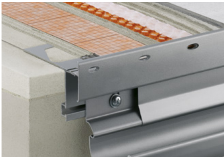
Assembly with Schlüter®-DITRA-DRAIN 4 and Schlüter®-BARA-RTKE