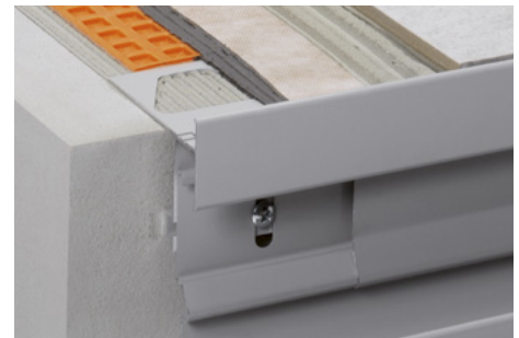
Assembly with Schlüter®-DITRA 25 and Schlüter®-BARA-RTKEG