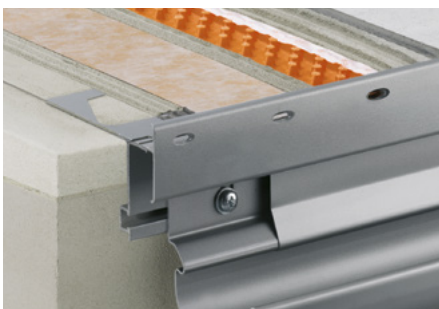
Assembly with Schlüter®-DITRA-DRAIN 8 and Schlüter®-BARA-RTKE