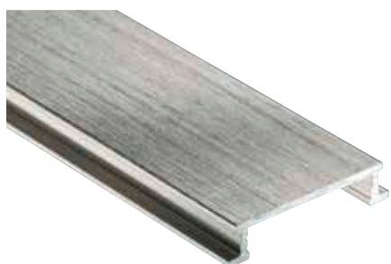
Schlüter®-DESIGNLINE-AGBE brushed anodised (-ATGB)