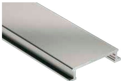
Schlüter®-DESIGNLINE-AME satin anodised (-AT)