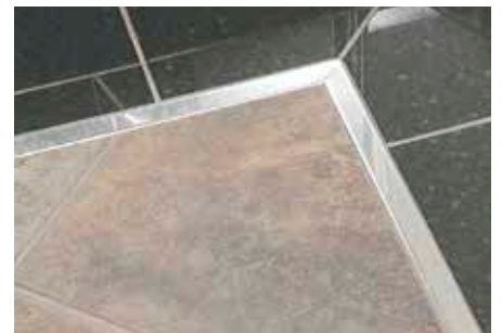
Schlüter®-DESIGNLINE-E in floor installation