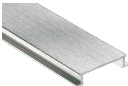
Schlüter®-DESIGNLINE-AGBE brushed anodised(-ACGB)